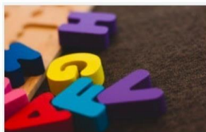
Speech and Language.