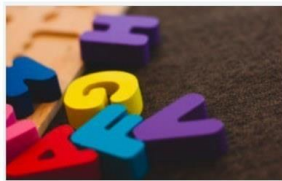
Speech and Language.