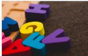
Speech and Language.